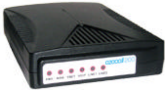
AzaCall200™ 2 Port SIP VoIP Terminal Adapter

The AzaCall200™ is a standalone VoIP terminal Adapter which effectively enables enhanced voice calls over the Internet from a regular telephone or PBX when connected to an Internet Telephony Service Provider.